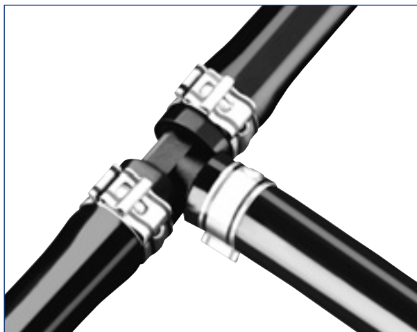
Used as a hose connector

Custom versions will be available if a sufficiently large quantity is ordered. Before use as a safety component, please consult the manufacturer. We reserve the right to make technical changes.